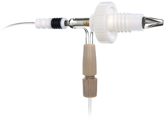
Prevents Nebulizer Bonding and Breaking

The Helix CT interface still maintains the original positive stop to ensure that the nebulizer is inserted to the correct and optimum depth within the spray chamber. However, the torque applied to the nebulizer seal is also critical. Consistent nebulizer depth combined with ConstantTorque provides the ICP analyst with unparalleled, reproducible day-to-day analytical performance.