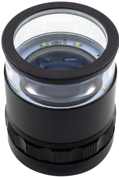
Magnifier Inspection Tool